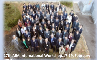
17 th AIM International Workshop, 17-19, February 2012