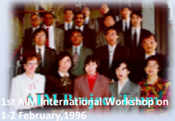
1st AIM International Workshop on 1-2 February, 1996