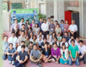
AIM Training Workshop on 2-14 August 2010