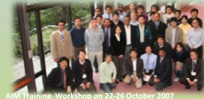
AIM Training Workshop on 22-26 October 2007