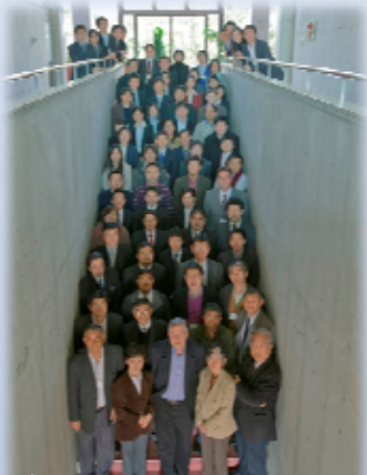
15 th AIM International Workshop on 20-22 February 2010