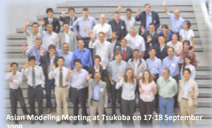
Asian Modeling Meeting at Tsukuba on 17-18 September 2009