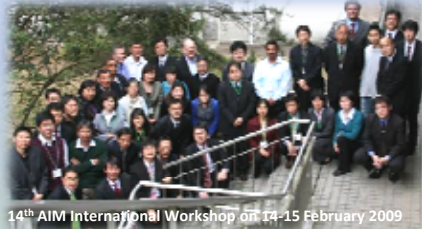
14 th AIM International Workshop on 14-15 February 2009