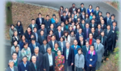
16 th AIM International Workshop on 19-21 February 2011