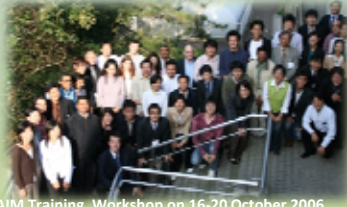
AIM Training Workshop on 16-20 October 2006