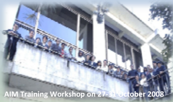
AIM Training Workshop on 27-31 October 2008