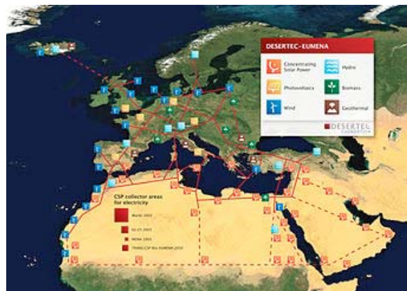
"Super grid"