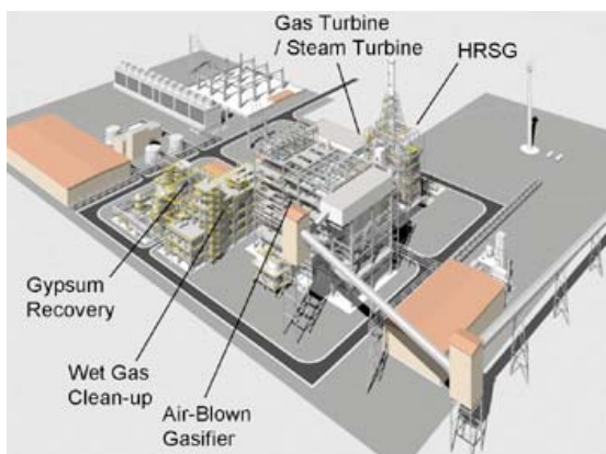
Integrated gasification combined cycle