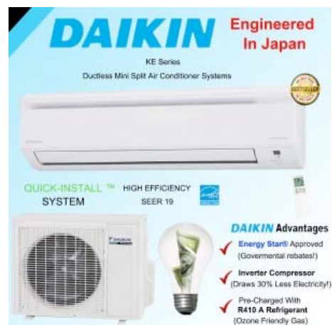
Energy efficient inverter compressor