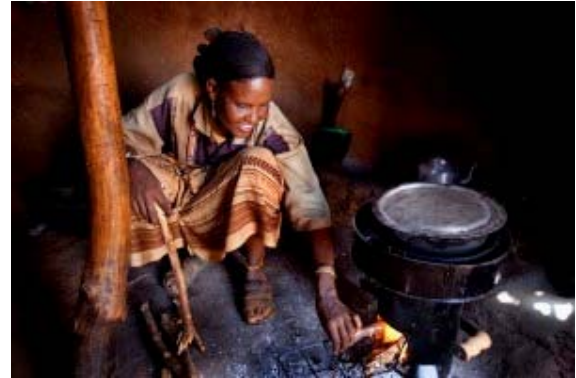
Energy efficient cooking stove