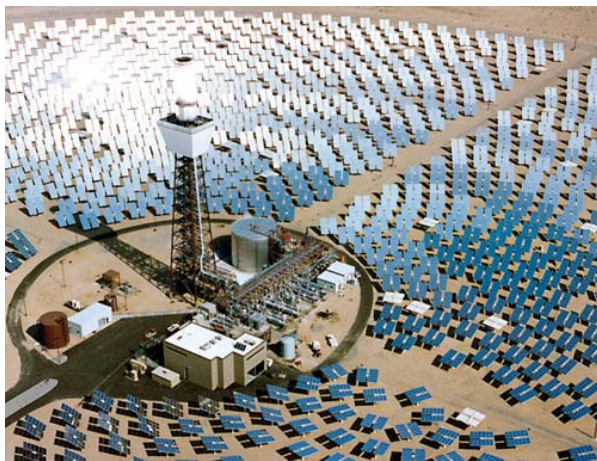
Solar thermal technology