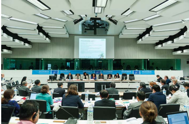
ENVforum Conference on SDGs Delivery 19-20 October 2016 Stockholm, Sweden