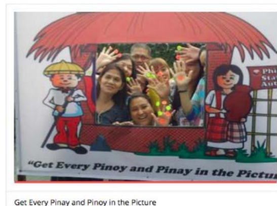
Get Every Pinoy and Pinoy in the Picture