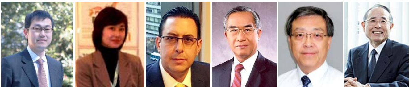
Moderator IGES Urban WB Tokyo Bangkok Yokohama FutureCity