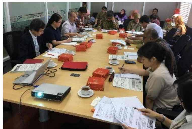
Improving waste management under the JICA Partnership Programme based on the Kawasaki-Bandung C2C Collaboration