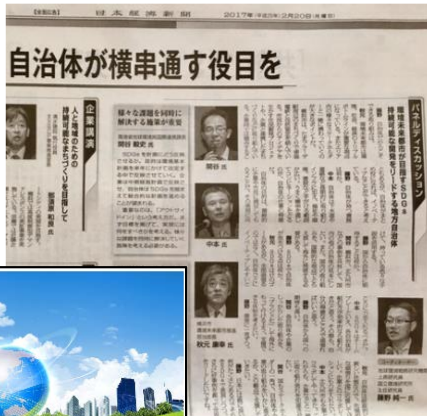
Nikkei SDGs Symposium January 2017