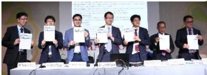
AIM Low-carbon City Scenario Development with NIES/AIM team, LCS Nov 2016@Marrakesh