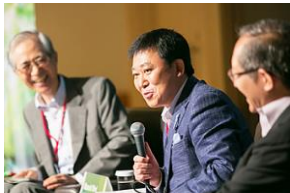
G7 EMM special session at ISAP2016 July 2016