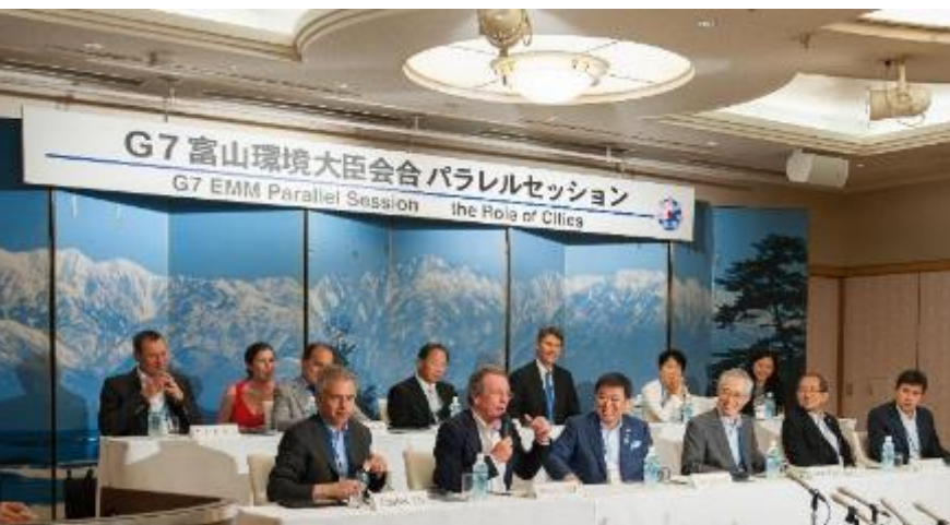
Parallel Session on Cities at G7 Environmental Ministers' Meeting May 2016