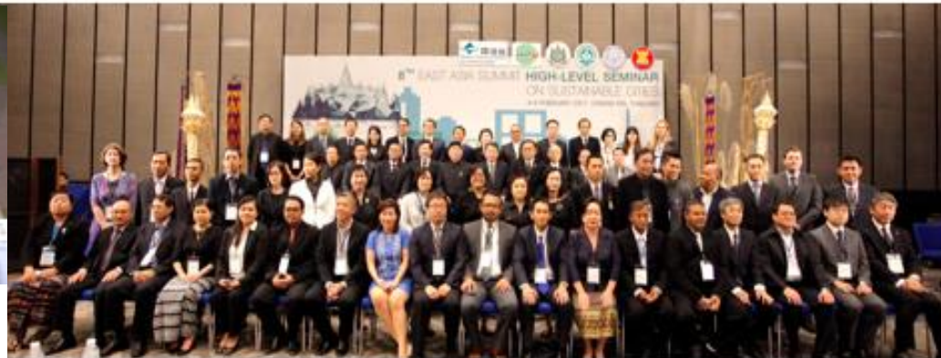
East Asia Summit High-Level Seminar on Sustainable Cities, Feb 2017@Chaing Rai