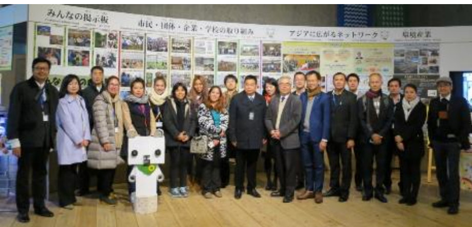
Peer to peer training on waste management through city-to-city collaboration Jan 2017@Kitakyushu