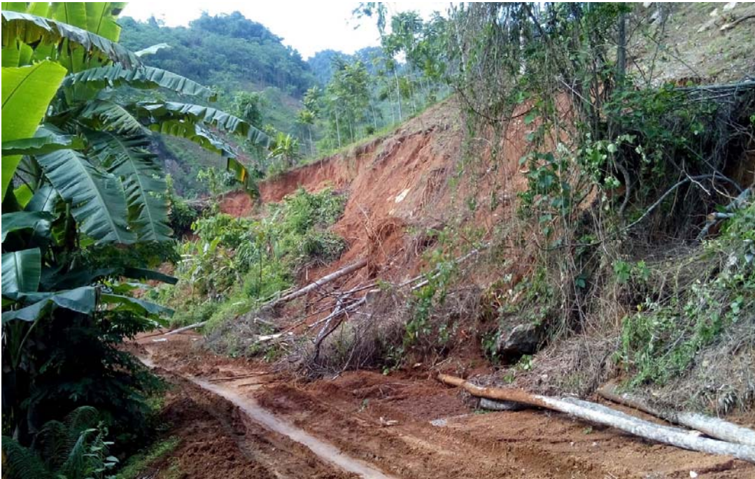
in Tuyen Quang Province in Vietnam