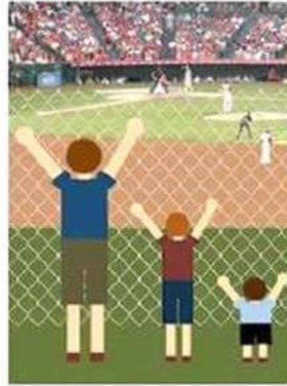
Changing the system