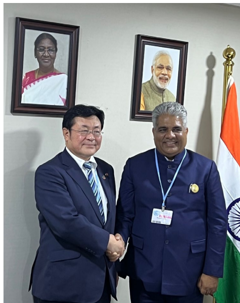
Bilateral meeting at COP27 (2022) MOEJ Minister Nishimura and MOEFCC Minister Yadav