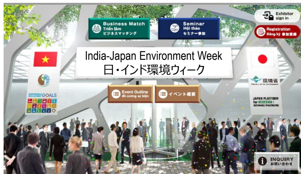
Japan-India Environmental Week web site (Top page image)