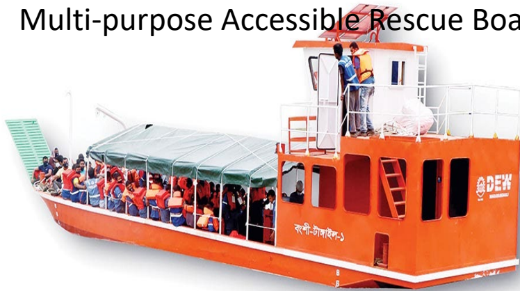
Multi-purpose Accessible Rescue Boat